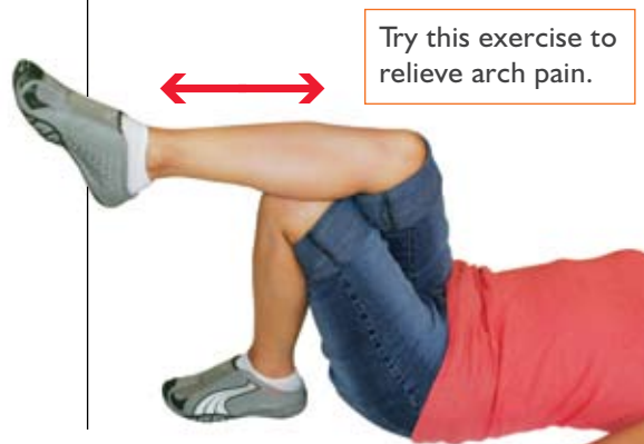
Try this exercise to relieve arch pain.

Arch pain might originate in the gastrocnemius muscle, the largest of the calf muscles. To relieve tension, lie on your back, bend knees and position the calf of one leg on top of the opposite knee. Move the top leg in long, parallel lines from the calf to the ankle, massaging with the bent knee.